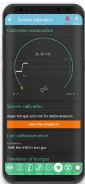
ENOTEC REMOTE app Simple control of ENOTEC analyzers