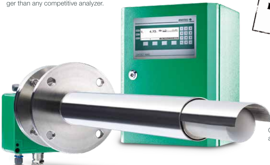
OXITEC 5000 safe area analyzer system

REDUCE EMISSIONS AND INCREASE FUEL EFFICIENCY