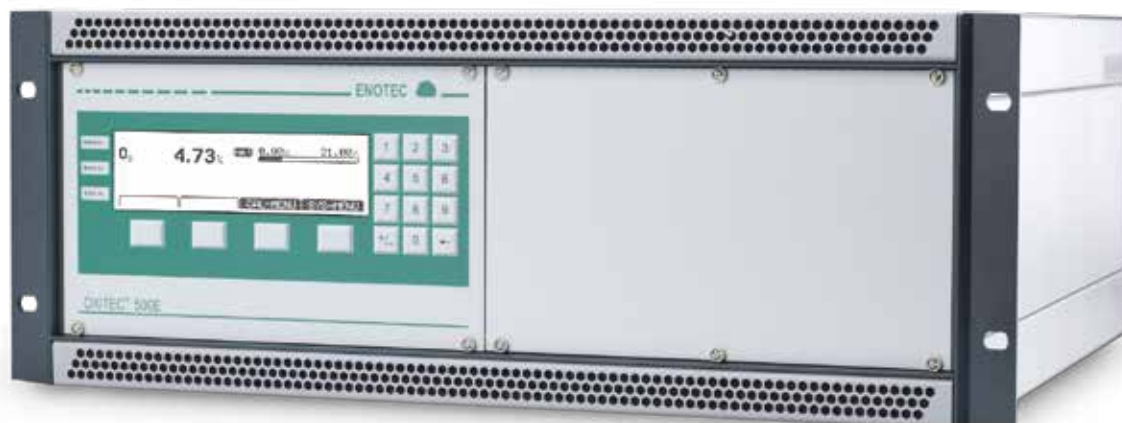
OXITEC 500E extractive analyzer