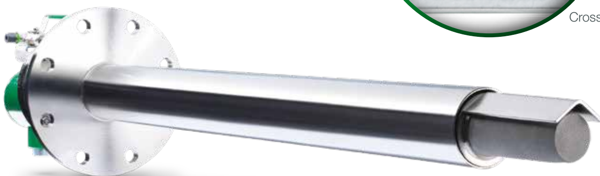
OXITEC KEX-5002 probe