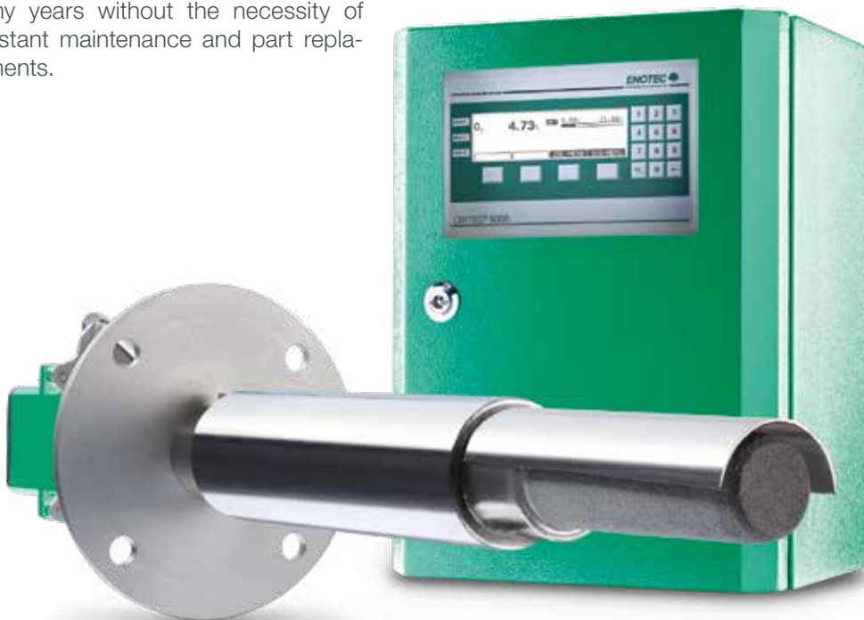
OXITEC Economy analyzer system

COST EFFICIENT AND MAINTENANCE FREE FOR MANY YEARS